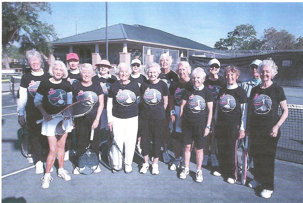
2013 Racquettes with their celebration shirts

What began as an opportunity for a group of women to get together for some friendly, competitive tennis play at the St. Petersburg Tennis Center emerged into one of the oldest – if not the oldest – tennis groups in the area. Last month, the Racquettes celebrated their 50th year of existence!